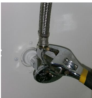
Fig. 5. Fig.

Note: The spacing dimensions between angle stops vary. Position the valve and tee hose connections to suit your system.