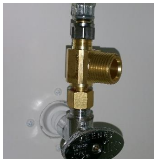
6. Fig. 7.