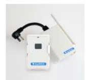
AMK-WB Wireless Button and Receiver