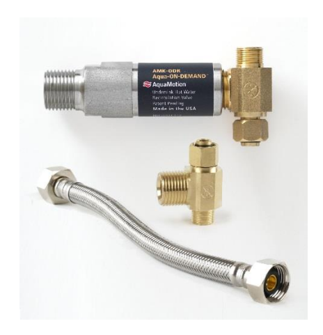
Components for Under Sink Installation