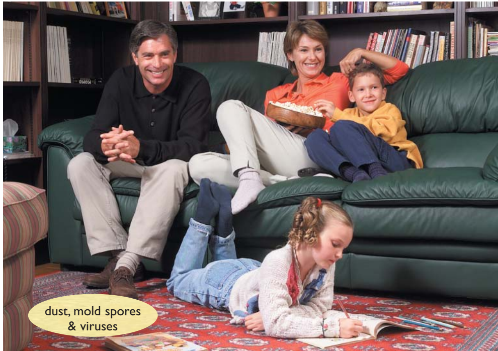
dust, mold spores & viruses

Fantech's Whole House HEPA installs independently or on your home's forced air furnace or air handler. The unit is small, compact, easy to install and very affordable. A powerful 240 CFM fan directs air through a series of three filters then delivers clean, safe, healthy air back into your entire home.