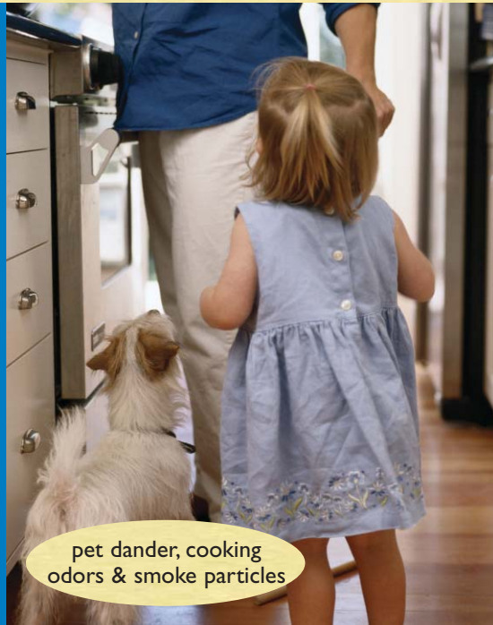
pet dander, cooking odors & smoke particles

Tighter houses prevent outside air from getting in, but they also prevent indoor air pollutants and allergens from carpet, pets, mold, plants, cooking and tobacco smoke from getting out. Your family could be breathing air that is five times more polluted than the air outside.