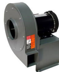
PW SERIES Direct Drive Pressure Blowers