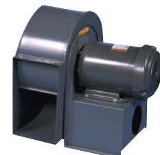
D SERIES Direct Drive Forward Curved Blowers