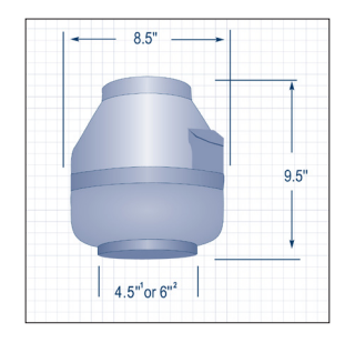
1-XP151, XP201 2- XR261