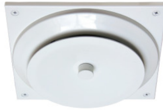
Model: TT-P Ceiling MINI Diffuser Panel