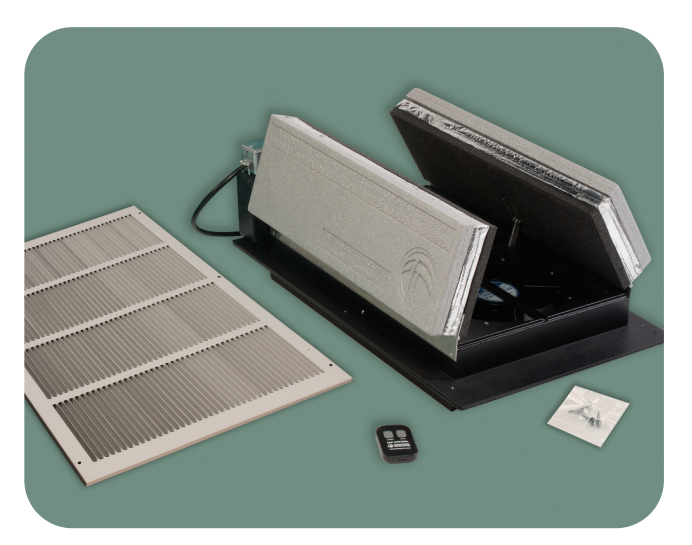
Package Includes: Grille, Remote Control, Fasteners and HV1600/R50 Fan