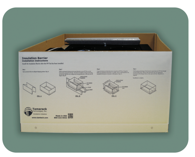
HV1600/R50 Fan shown with OPTIONAL Insulation Barrier