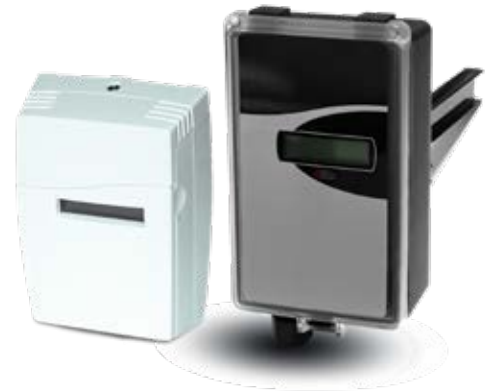
Sensors sold separately