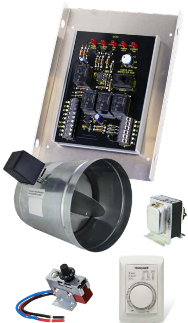
Outdoor Thermostat iO-ODT

The Fresh Air Ventilation system is designed to introduce fresh air into a home through an intake damper controlled by a micro-processor logic panel. The iO-FAV has single adjustment setup, exhaust fan control option, outdoor temperature and/or humidity limit option and damper override capabilities. It is easy to install and meets ASHRAE Standard 62.2. The iO-FAV kit comes with a control panel, 20VA transformer and 6" or 8" round damper. The control panel is available separately (iO-FAVPAN) and can be ordered with additional size dampers.