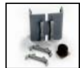
Optional DRC DIN Rail Adapter