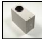
Optional ENC1 Enclosure