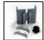
DRC DIN Rail Adapter