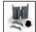
DRC DIN Rail Adapter