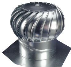
GEB-12 & GT-12 (shown) GALVANIZED STEEL TURBINE †ADJUSTS TO 7/12 ROOF PITCH AVAILABLE IN MILL ONLY