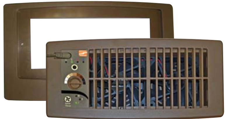
Also available in brown!

Suncourt's Flush Fit Register Booster™ increases airflow to under performing registers improving comfort in rooms that are too hot or too cold. The Flush Fit Register Booster's™ quiet 3-speed, dual fans pull extra air out of weak registers, boosting airflow by up to 85%.