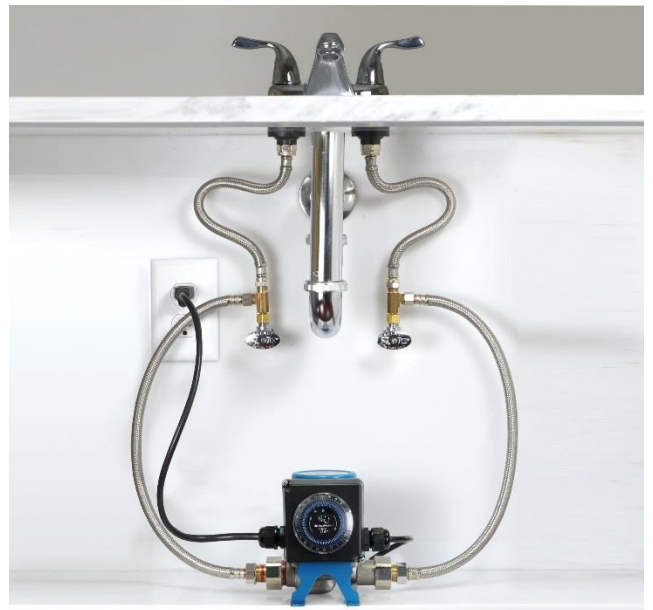
AquaMotionHot One AMH3K-7 Installation Picture