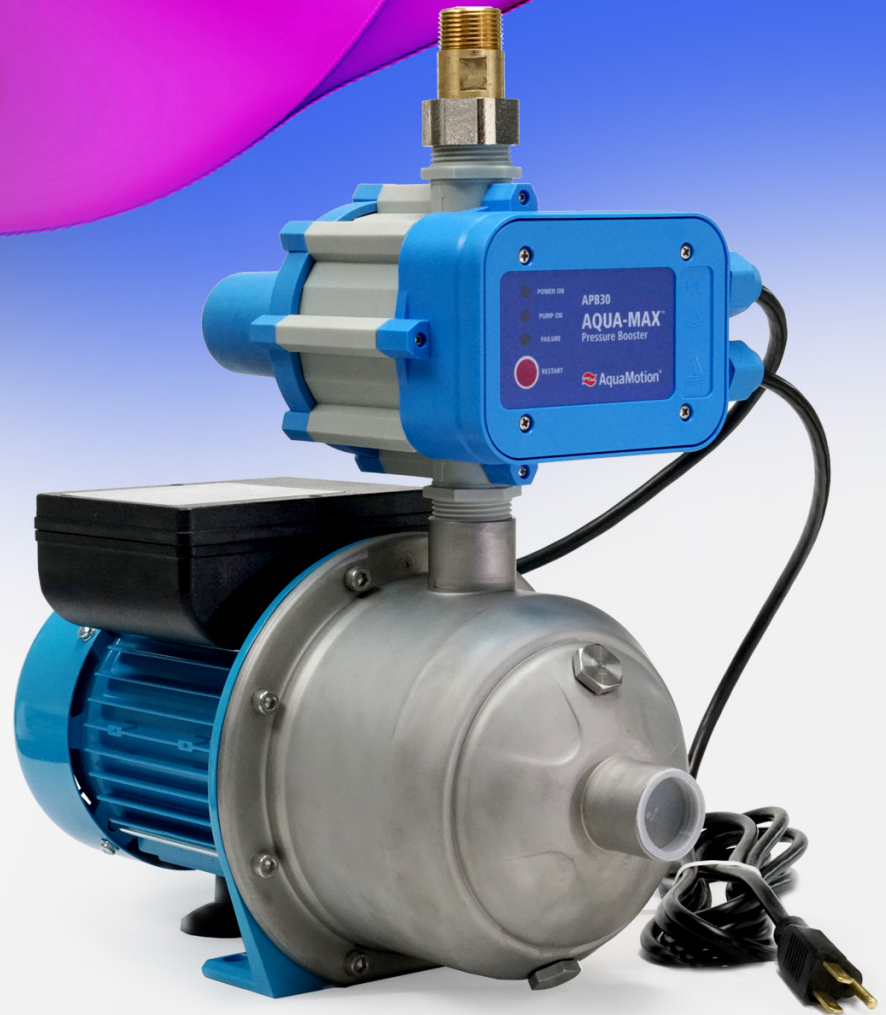
AquaMotion APB 30