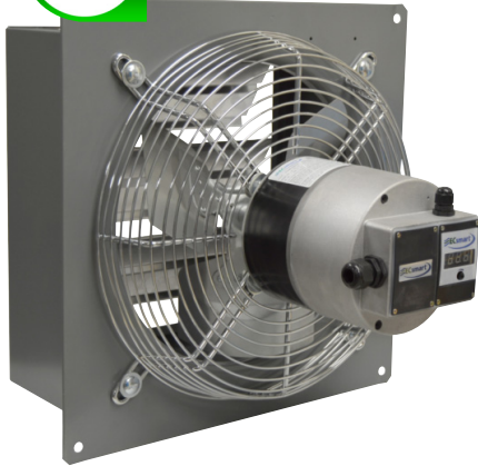
May not be as shown