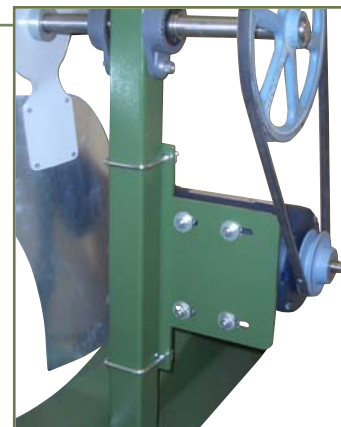
HEAVY STEEL POST MOUNT

The XBL series is constructed for efficient, economical operation and are designed to be used primarily as exhaust fans.