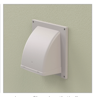
Low profile and aesthetically pleasing design