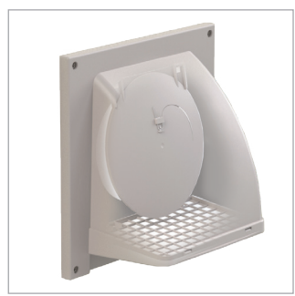
Spring loaded damper reduces flapping