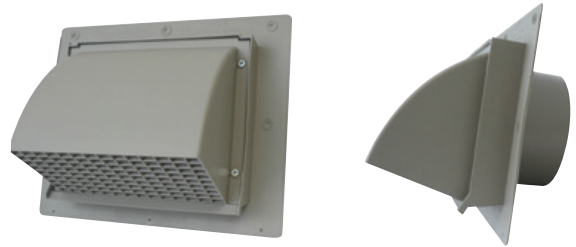
WC631 - Light Grey