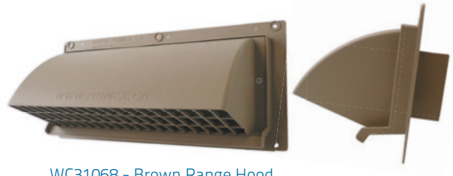
WC31068 - Brown Range Hood