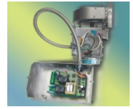
New HSJ, HS1 & HS2 includes UC1 Control