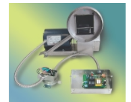
New HS3, HS4 & HS5 includes UC1 Control