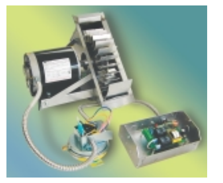
In-Line Draft Inducers with optional UC1 Control and PS1505 Fan Proving Switch