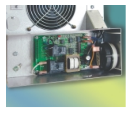
SideShot® Model SS1 & SS2 includes UC1 Control (Note: New Fan Prover for SS2)